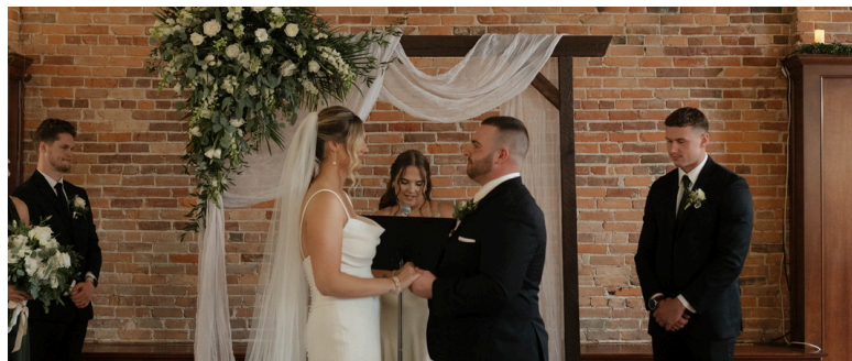
The Point Ceremony